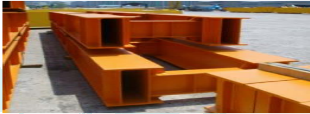
Loading Beam / 13.2m x 2.0m x 1.0m (Longest) Shipped on a Ro-Ro vessel with an evaporator for local transportation to job site.